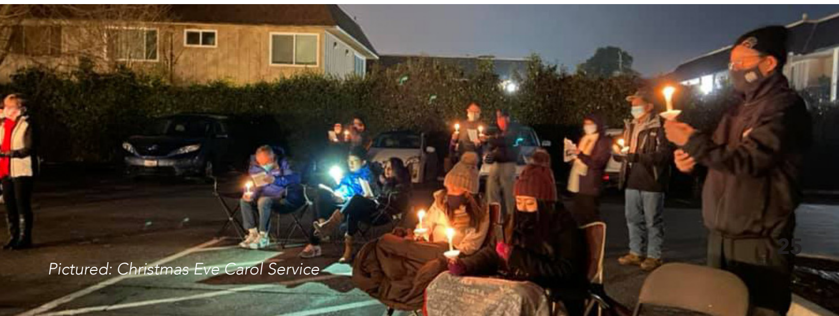
Pictured: Christmas Eve Carol Service

Exchanged-Traded Funds (ETFs) Closed-Ended Funds (CEFs)