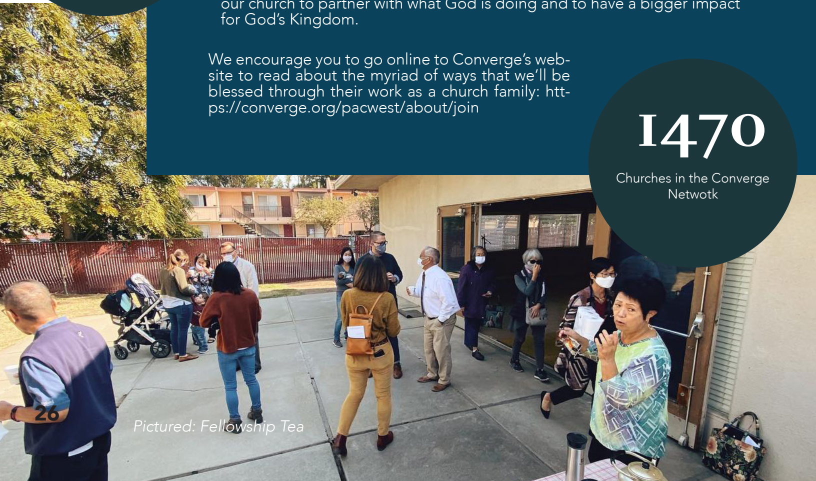
Pictured: Fellowship Tea