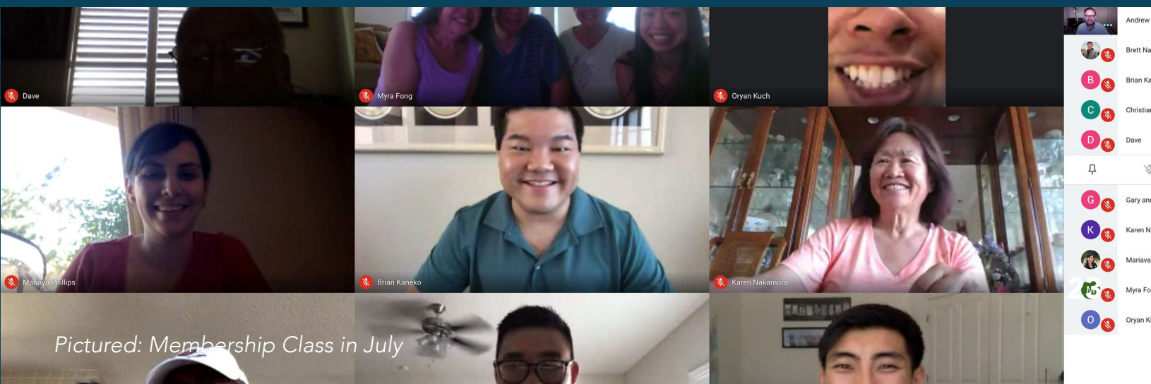
Pictured: Membership Class in July

A series of seminars and classes designed to help you understand and apply the Bible to your every day life. In 2020 we held two seminar-style classes and went deeper into God's word by studying the Psalms over the Summer, and in December looking at the theology of grace and gift. Join us in 2021 for several more seminars, as well as two residential learning days with guest speakers.