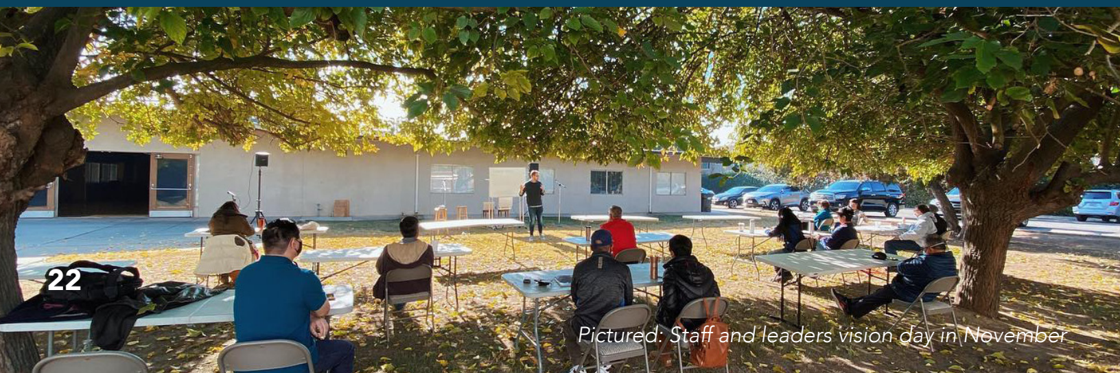
Pictured: Staff and leaders vision day in November